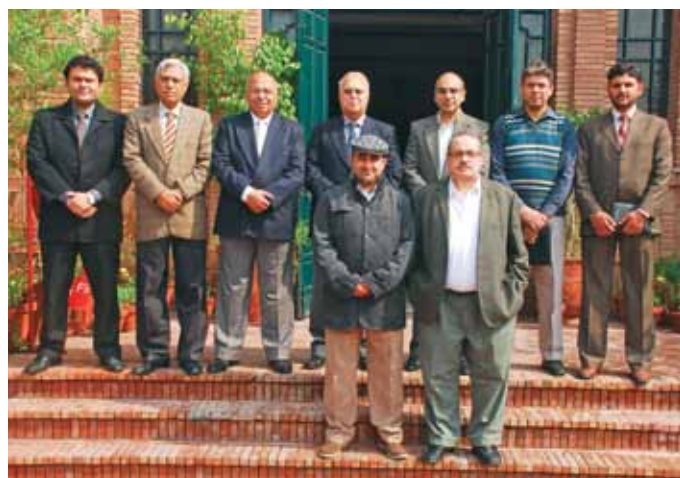
Vice Chancellor at Virtual University Lahore