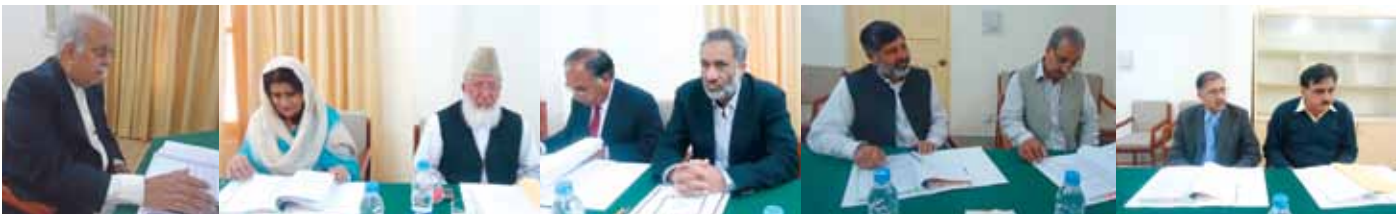
THE Vice Chancellor Chairing first meeting of selection board