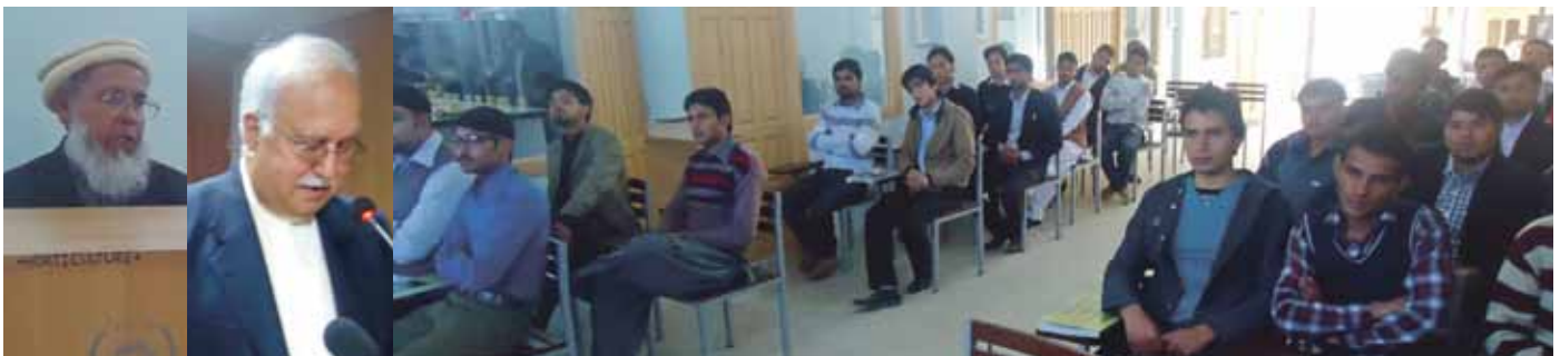
The VC Addressing New Students of Electrical Engineering Department