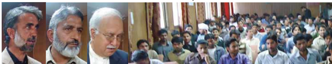
Vice Chancellor addressing the members Chinar Vet Care Society