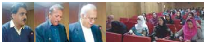
VC addressing the trainee of short term Skill Development Course

A training project approved by the National Vocational and Technical Training Commission (NAVTTC) entitled "Short Term Skill Development Courses under Prime Minister's Hunarmand Program" in two trades i.e. Livestock Manager (LSM) and Farm Manager (FM) for the period of one year