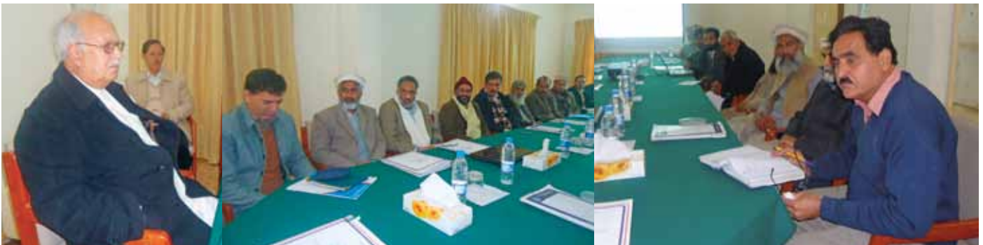
Vice Chancellor Addressing The Meeting of Deans, Directors, Chairmen And Principal Officers.