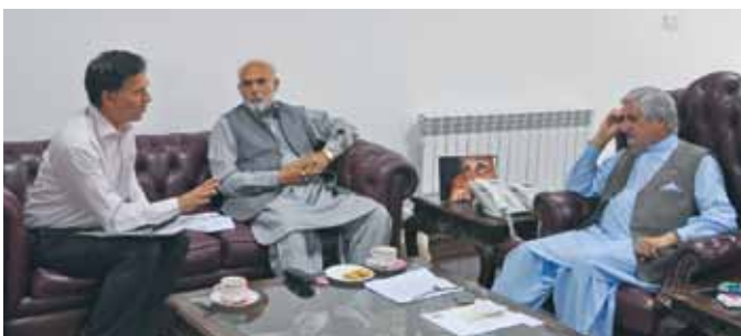
Treasure briefing the Chancellor and speaker AJ&K Assembly