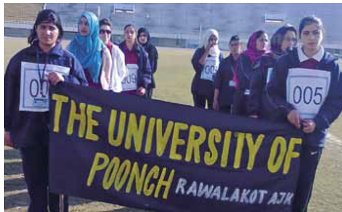
Girls athletic team of UPR

♦ All Pakistan Inter university Cricket Championship was held at COMSATS University from February 10-15, 2013. The UPR won the first and lost 2nd match.