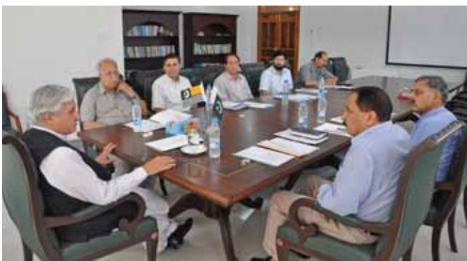
Sardar Haji Muhammad Yaqoob Khan the President State of AJ&K chairing the Vice Chancellors meeting