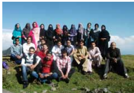
A Group of MBA 3rd semester on field visit at Tolipir