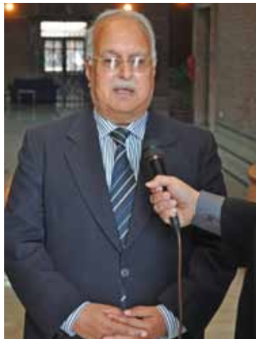
VC Sharing views with media