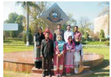
Participants of UPR in all Pakistan Students week