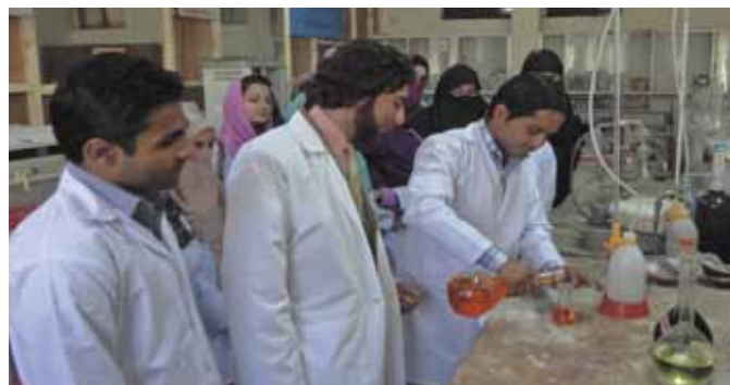
Students of M.Sc. Chemistry busy in their lab work

On persistent demand from local student community. The University has started two years master's degree programs under the Faculty of Basic and Applied Sciences, Physics Mathematics, Chemistry, Zoology and Computer Sciences and in Faculty of Management Sciences and Humanities, two years master programs in Economics, English, Sociology and Commerce. A positive feedback from student was received and more than 412 students have been enrolled.