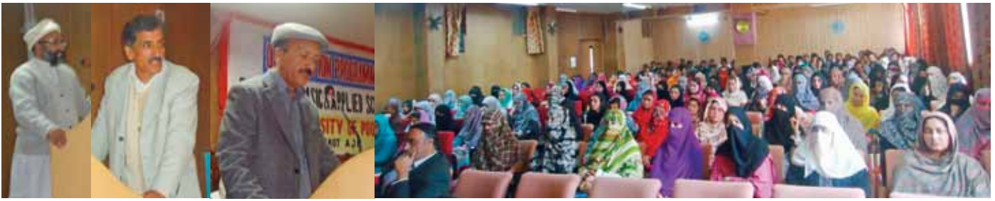
Dean Faculty of basic and applied sciences addressing the new students