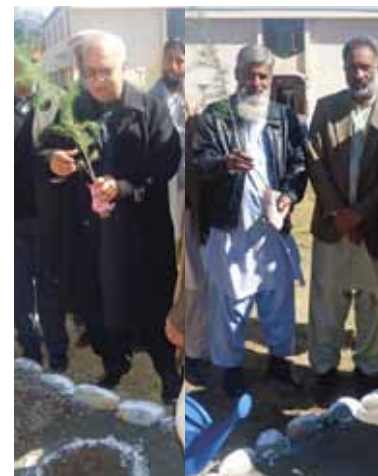
The VC Planting a Tree