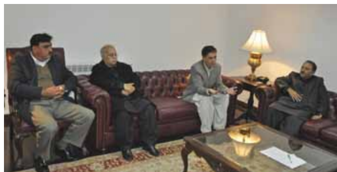
Vice Chancellor meeting with chairman public accounts committee

In his inaugural address, the honourable President of the State of Azad Jammu & Kashmir/Chancellor of the University of Poonch Rawalakot addressed the honourable members of the Senate. While describing the need of the University the President said that Poonch division is a densely populated area and people of the area are keenly interested in quality education and literacy rate of the area were very high as compared to the other district and divisions of Azad Jammu & Kashmir including Pakistan. The students of the division had to seek admission for higher studies in various universities of the country and that had created extra financial burden for the students/parents. Keeping in view the difficulties, the faculty of Agriculture Rawalakot has been up-graded to a full fledged university. The