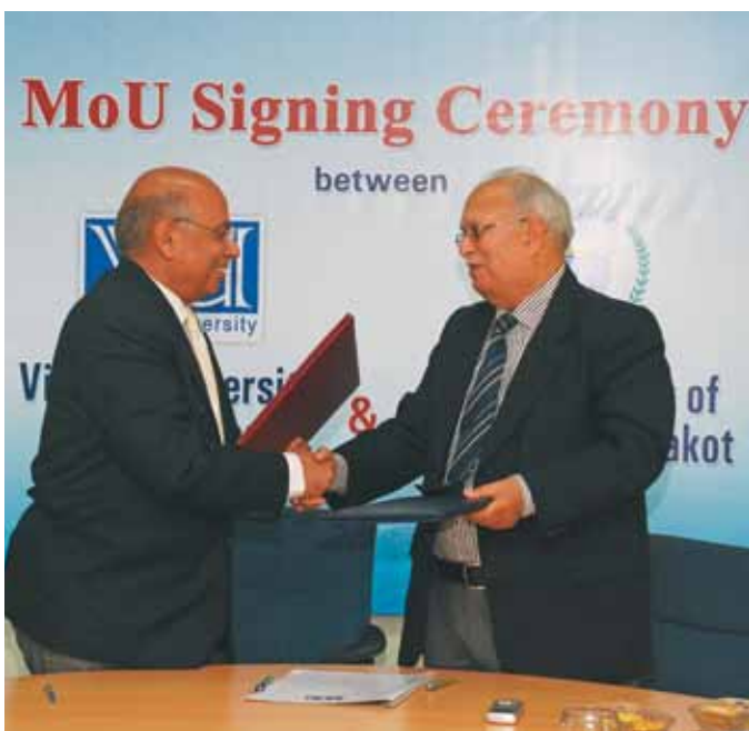
The VC UPR and VC VS Signing MOU