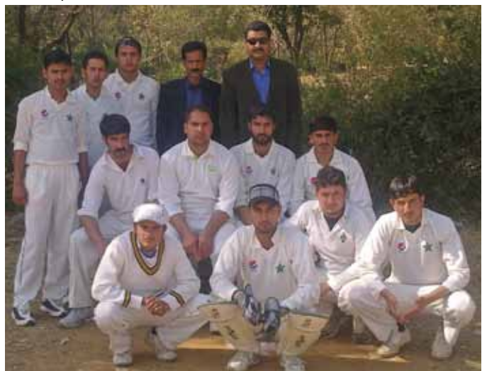
Cricket team of UPR

♦ The University of Poonch Rawalakot AJ&K participated in all Pakistan inter university volleyball Championship which was held from March 4-8, 2013 at Pir Mehr Ali Shah Arid Agriculture University Rawalpindi.