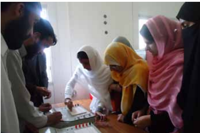
Students of M.Sc. Physics Performing lab experiment

The orientation program of Faculty of Basic and Applied Sciences was held on March 11, 2013.