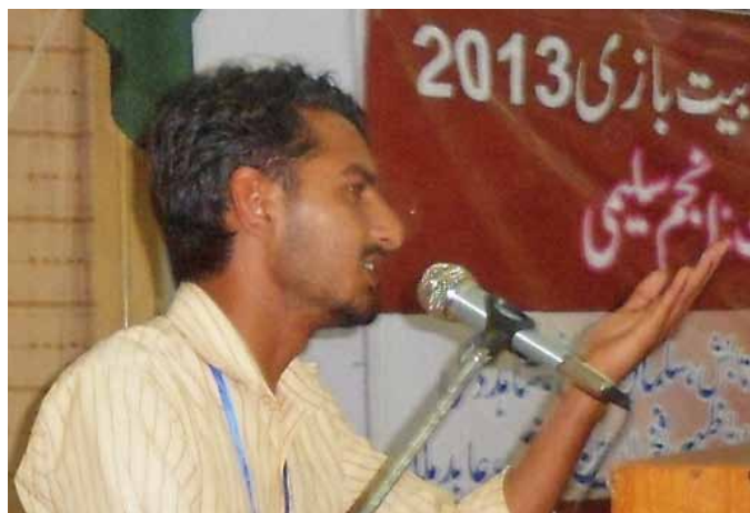
Zia-ur-Rehman Students of UPR from different disciplines performing in All Pakistan week at AU Faisalabad